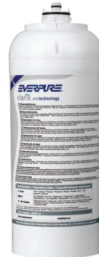
Claris Large Filter Cartridge: EV4339-12

Everpure Claris water treatment systems are covered by a limited warranty against defects in material and workmanship for a period of one year after date of purchase. Everpure replaceable elements (filter cartridges and water treatment cartridges) are covered by a limited warranty against defects in material and workmanship for a period of one year after date of purchase. See printed warranty for details. Everpure will provide a copy of the warranty upon request.