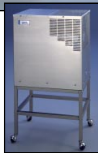
shown with optional floor stand