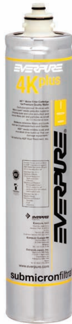
4K-Plus Replacement Cartridge: EV9612-71

Delivers premium quality water for foodservice, vending and OCS applications