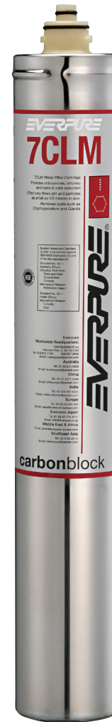
7CLM Replacement Cartridge: EV9693-01 1 PK

NSF Certified under NSF/ANSI Standards 42 and 53.