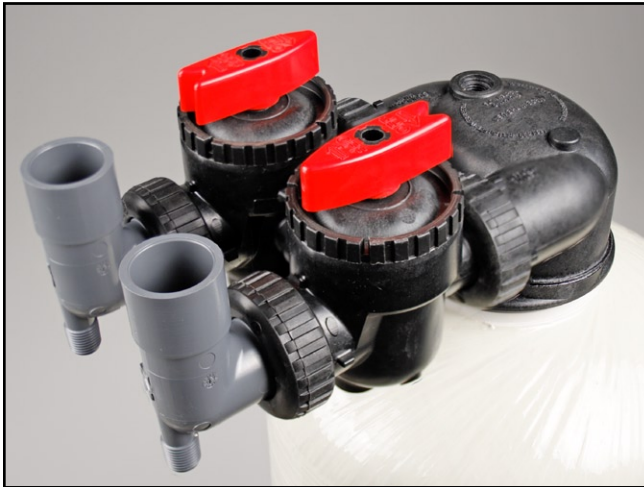
1191 In-Out Head shown with optional V3006 Bypass Assembly and V3007-01 3/4" x 1" PVC Solvent Elbow Assembly