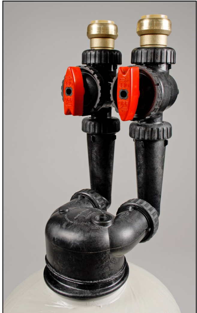
1191 In-Out Head shown with optional V3191-01 Vertical 90° Adapter Kit, V3006 Bypass Assembly and V3007-13 1" SharkBite® Fittings