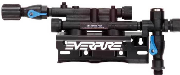
Twin Series Head: EV9272-24

Engineered for durability, strength and longevity. Will not corrode