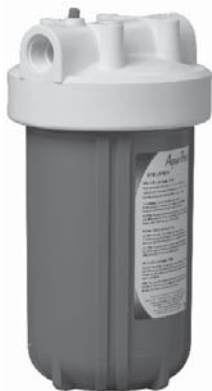
AP801 / AP801-C