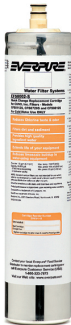
EFS8002-S Replacement Cartridge: EV9781-12

Replacement filter for Cuno® Series 8000 systems