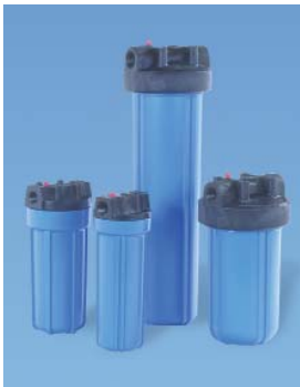
Residential & Commercial 4200, 7000, 4500, 8000 series.

We offer a complete line of under counter filter housings for virtually every application where single cartridge housings are typically used. Select from standard, heavy duty, full-flow, high purity, high temp and valve-in-head models.