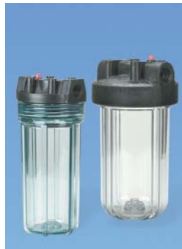
Clear housings To know when cartridge replacement is necessary.