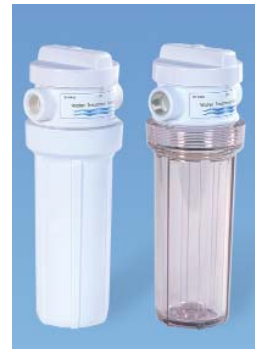
Valve-In-Head Three function valve with shut-off in clear or opaque.