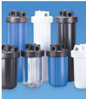
Full-Flow (B-B) 5000 & 10000 series.