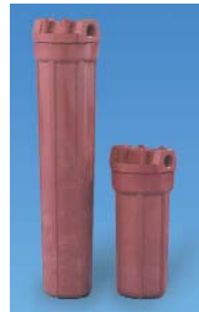
High-Temp For 200°F (93°C).