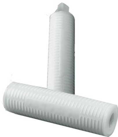
figure 1 : Memtrex MP-E (MMP-E) filters