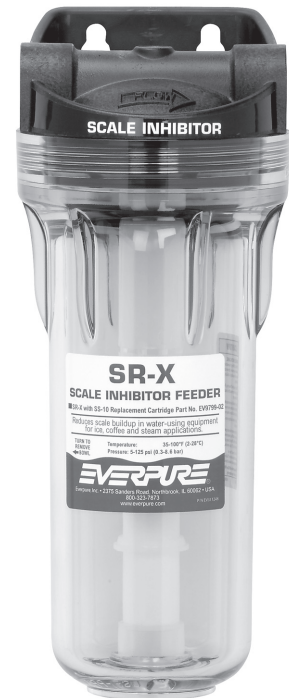
SR-X Scale Reduction Feeder