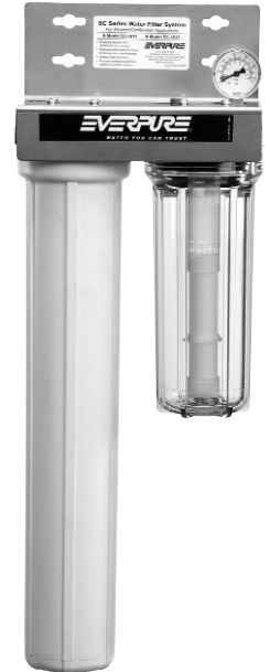
Figure 2 - SC-1021 System