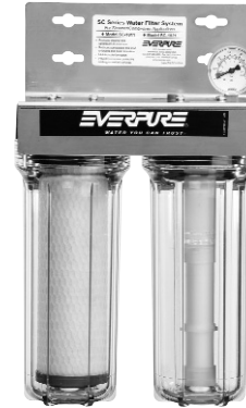
Figure 1 - SC-1011 System