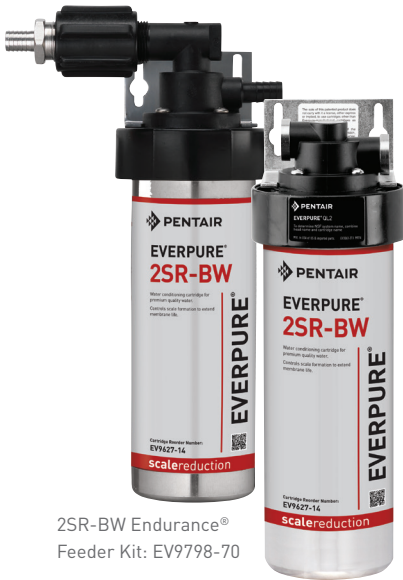
2SR-BW Endurance® Feeder Kit: EV9798-70

EXPAND YOUR WATER FILTRATION SYSTEM WITH THIS SCALE INHIBITOR FEEDER SYSTEMS