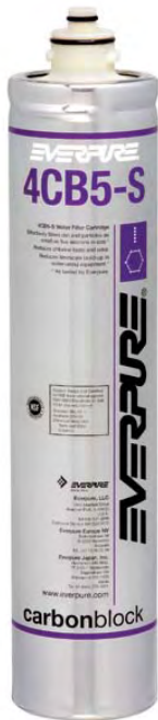
4CB5-S Replacement Cartridge: EV9617-21

Delivers quality water for foodservice, vending and OCS applications