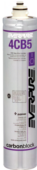
4CB5 Replacement Cartridge: EV9617-11

Delivers quality water for foodservice, vending and OCS applications