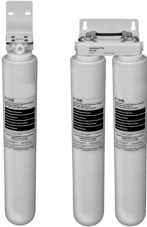
SGP-124B Rated for 422.6 gal. (1,600 lit.) @ 180 ppm