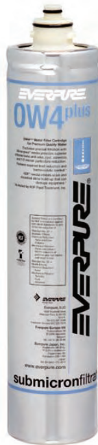
OW4-Plus Replacement Cartridge: EV9635-01

Delivers premium quality drinking water for bottleless coolers and drinking fountains