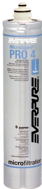
MicroGuard™ Pro 4 Replacement Cartridge: EV9637-02

Delivers premium quality drinking water for bottleless coolers and drinking fountains