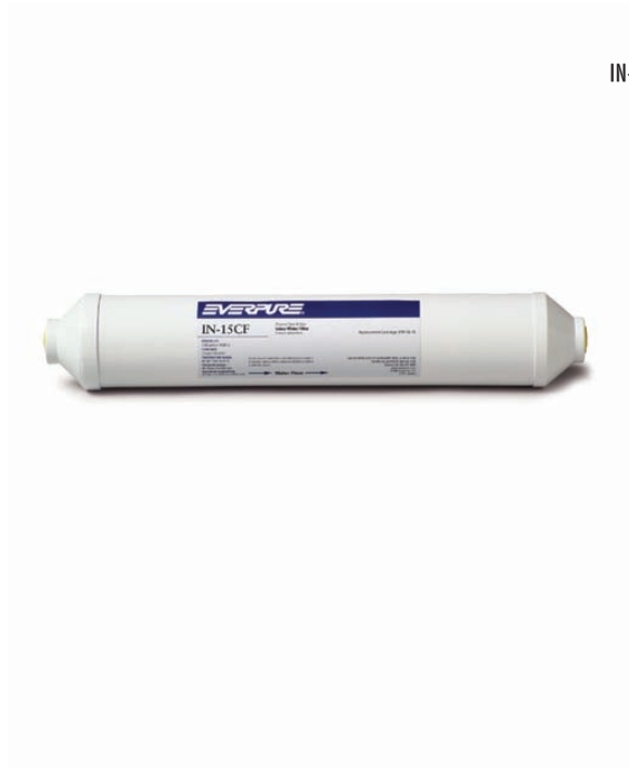
IN-15 CF: EV9100-76

Designed for great taste and odor reduction