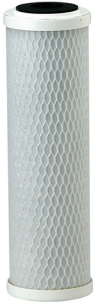
CG53-10 Replacement Cartridge: DEV9108-53