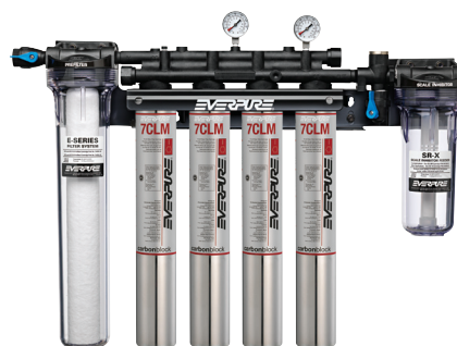
High Flow CSR Quad 7CLM EV9329-54