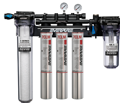
High Flow CSR Triple 7CLM EV9329-53