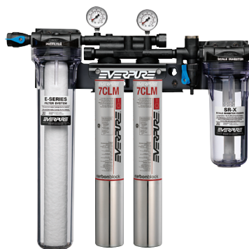
High Flow CSR Twin 7CLM EV9329-52

Everpure water treatment systems (excluding replaceable elements) are covered by a limited warranty against defects in material and workmanship for a period of five years after date of purchase. Everpure replaceable elements (filter cartridges and water treatment cartridges) are covered by a limited warranty against defects in material and workmanship for a period of one year after date of purchase. See printed warranty for details. Everpure will provide a copy of the warranty upon request.