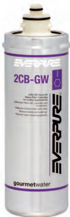
2CB-GW Replacement Cartridge: EV9618-36

Delivers quality water for foodservice, vending and OCS applications