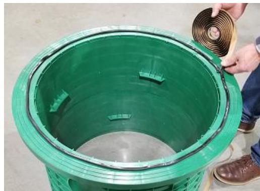
Firmly press the butyl to the TAR to form a full ring.