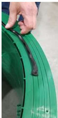
Apply the butyl to the BOTTOM of the TAR